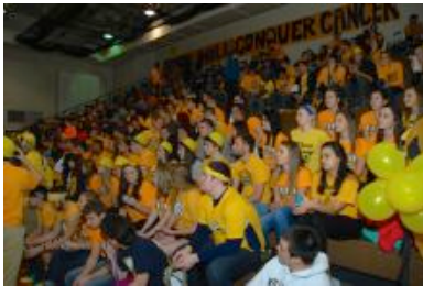
Students wore gold to show their support at the Gold Rush basketball game.