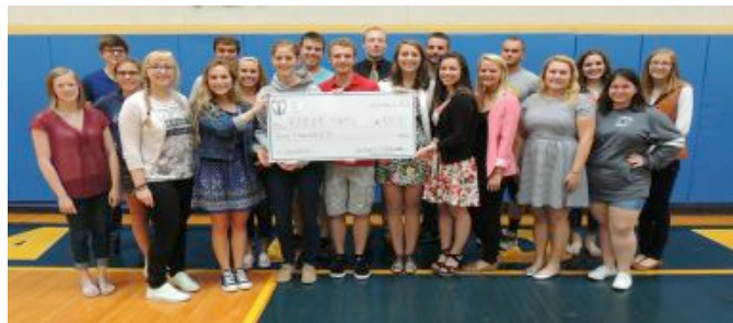
Pictured above are the ELCO Honor Society members sharing their incredible donation of $400 with the RaiderTHON officers.