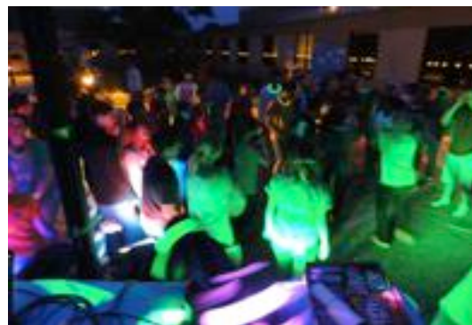
Glowing fun at the RaiderTHON dance.

http://raiderminithon.wikispaces.com for more pictures of the 2014 - 2015 events.