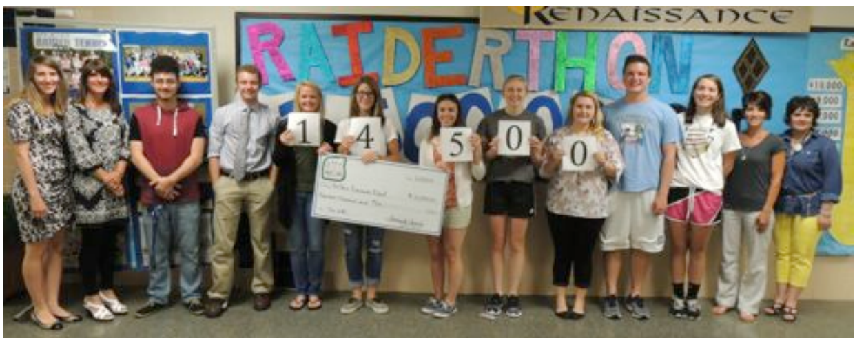
ELCO RaiderTHON Advisors and Officers proudly display the $14,500 donation for Four Diamonds Fund.