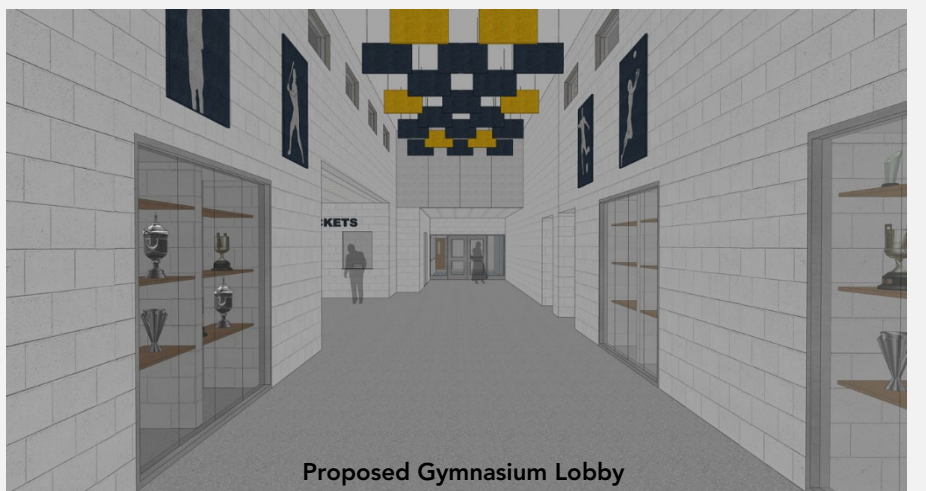
Proposed Gymnasium Lobby