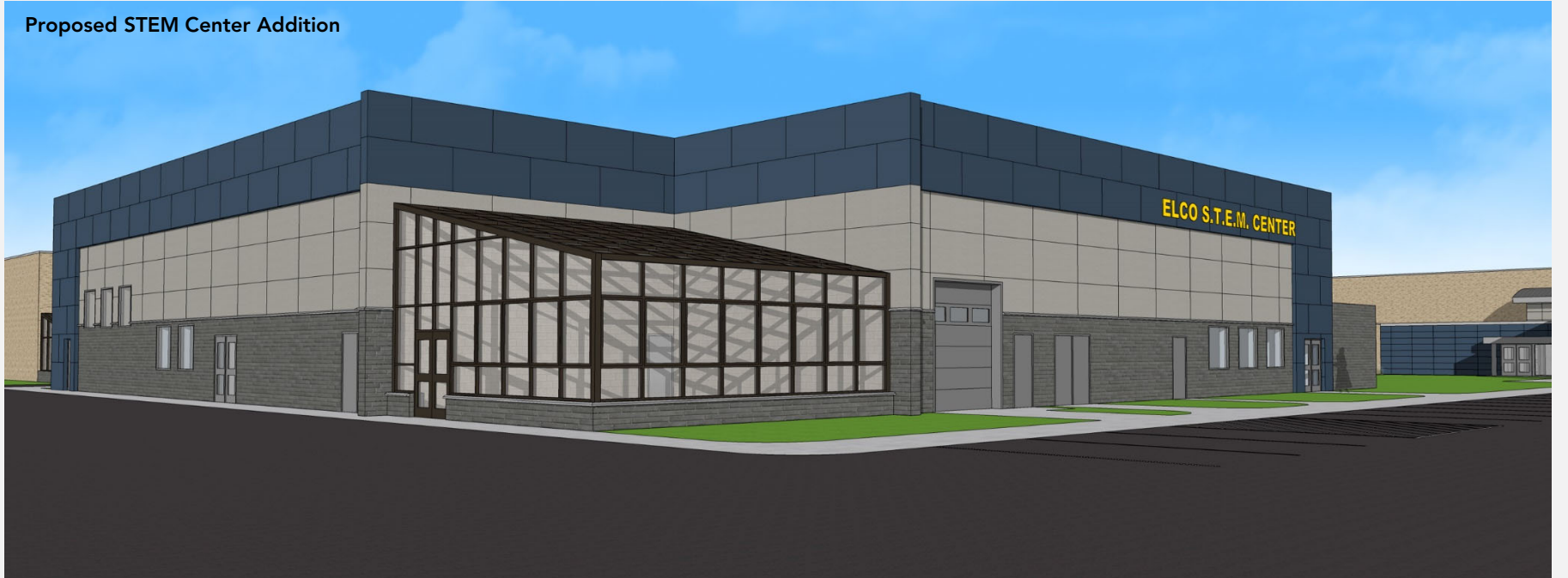
Proposed STEM Center Addition