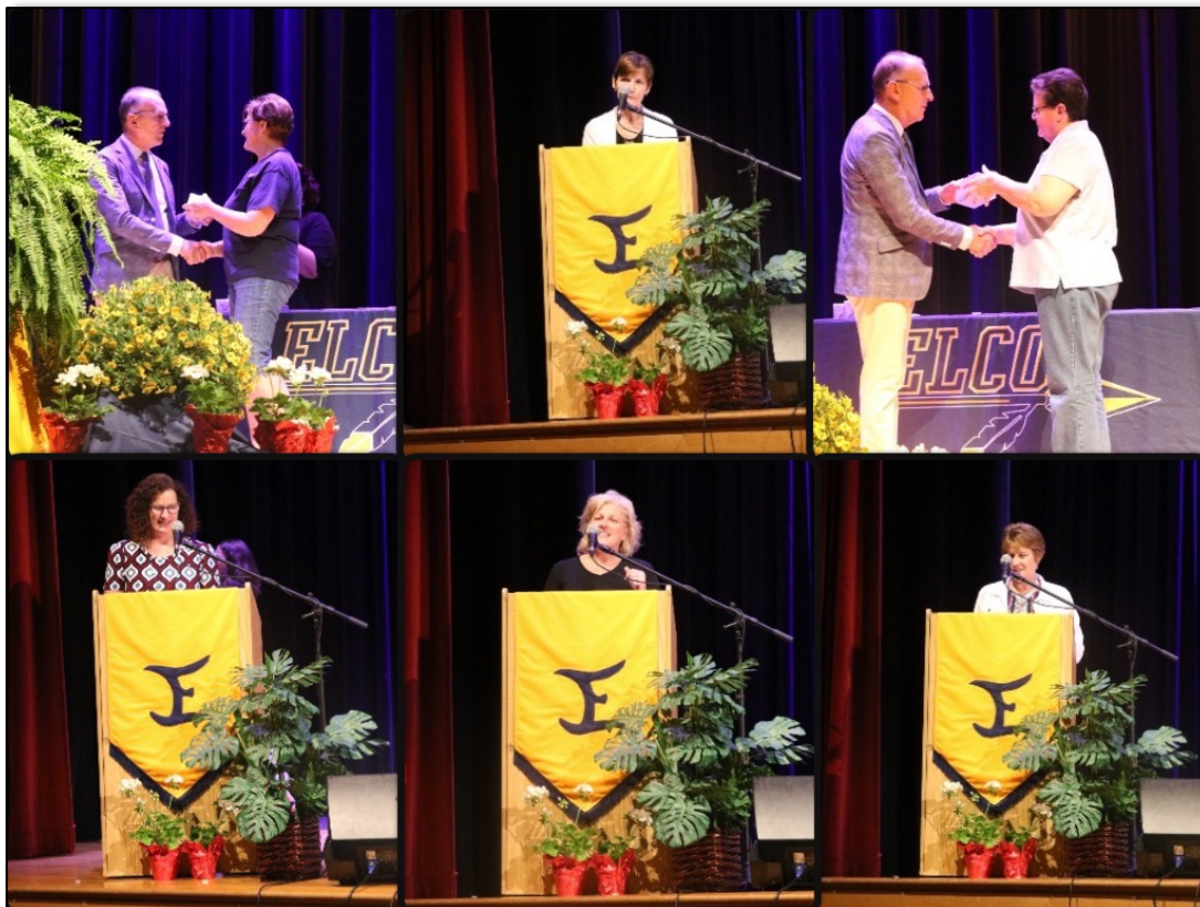
Pictured top left to bottom right: